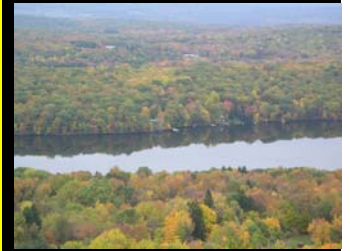
The top of the ridge during our 2-mile hike on the last day of camping.

The children spent three days at the Fairview Lake Campsite and learned many wonderful things about the environment and themselves. Most importantly they learned how to accomplish certain goals while working with each other. The Spring Garden Camping trip of 2005 was a great experience for the children, chaperones, and teachers.